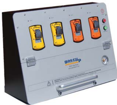
SGC Wall Mount Dock