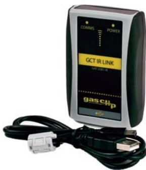
GCT IR Link